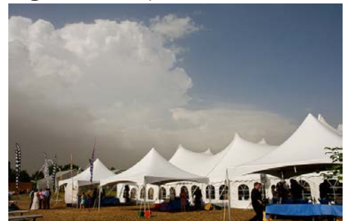
We had a successful fundraising dinner despite the stormy weather!