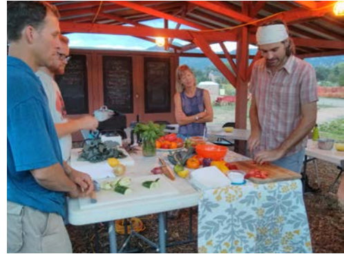
2013 Garden to Table Cooking Class

Over 2,242 pounds of produce was donated through Growing Gardens' Community Gardens and our ¡Cultiva! Youth Project.