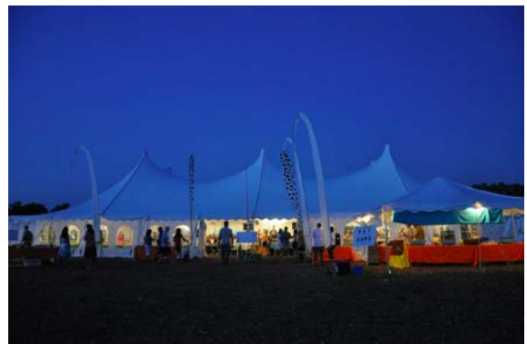
We had a great ¡Cultiva! Harvest Dinner and Community Plant Sale this year!