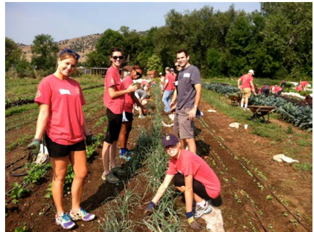
Thank you to our great volunteers!

Over 1,200 pounds of produce was donated through Growing Gardens' Community Gardens and our ¡Cultiva! Youth Project.